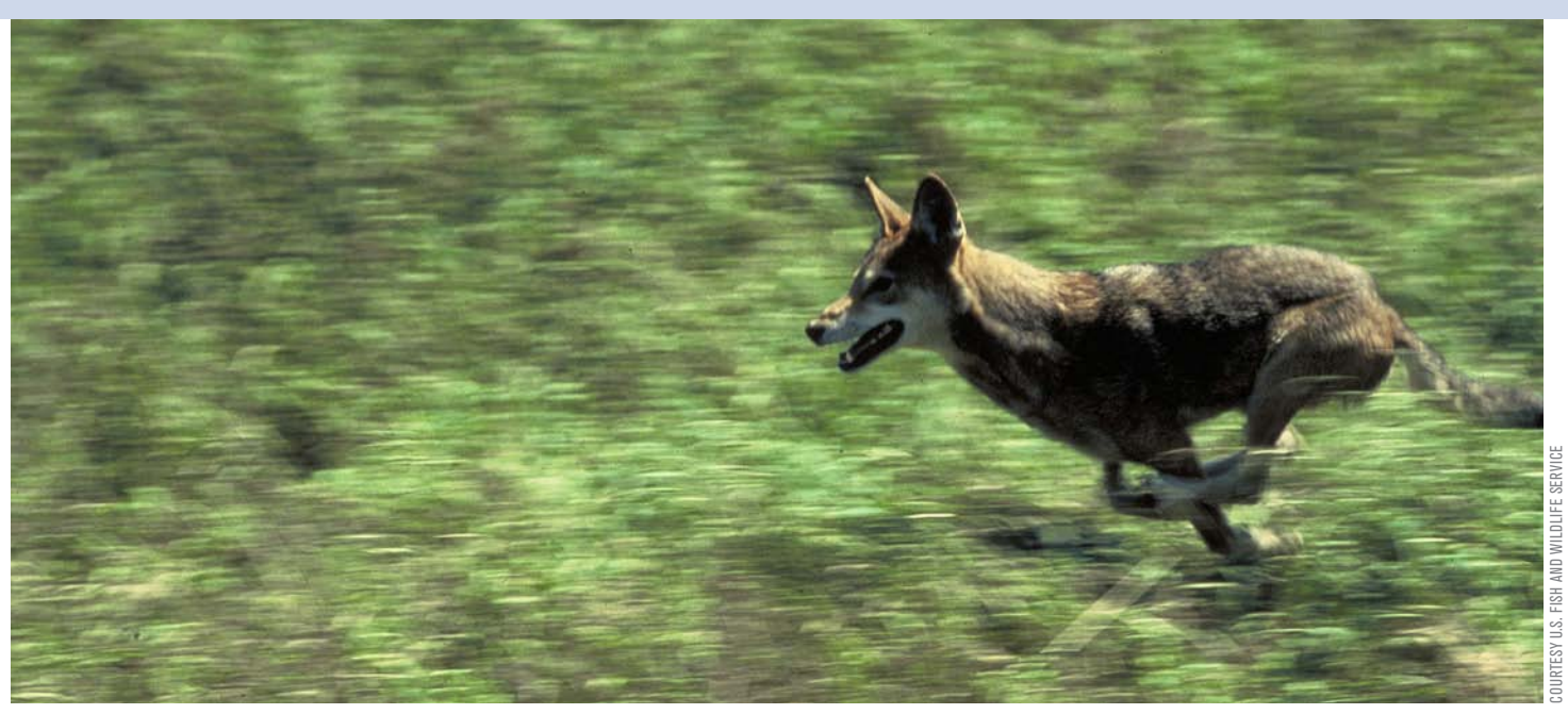
The red wolf, a Southeast native, was saved from extinction by a captive-breeding and reintroduction program.

The red wolf (currently recognized as a different species than the gray wolf) once ranged as far north as Pennsylvania and as far west as central Texas. Because of its wide distribution, the red wolf played an important role in a variety of ecosystems, from pocosin lowlands to forested mountains. Persecuted like their gray cousins, by the 1970s red wolves existed only along the Gulf Coast in southeastern Texas and southwestern Louisiana.