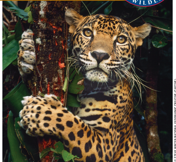
© STEVE WINTER/NATIONAL GEOGRAPHIC CREATIVE (CAPTIVE)

SINCE PRE-HISPANIC TIMES the jaguar ( Panthera onca ) has been represented as one of the most important deities in the different cultures that inhabited the New World. The Mayans, Incas and Aztecs, three of the largest empires in America, worshiped the jaguar as a god. Across these cultures the jaguar served as a symbol of power and courage. With its mythological and spiritual representation, the jaguar is one of the most emblematic animals of Latin America.